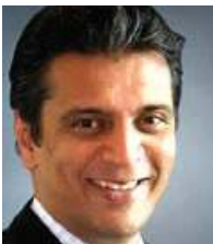
RAJ SUBRAMANIAM CEO, FED-EX