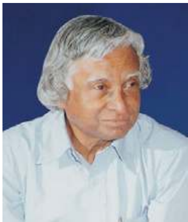
Bharat Ratna Dr A. P. J. Abdul Kalam Former President of India