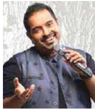
PADMASHRI SHANKAR MAHADEVAN RENOWNED FILM PLAYBACK SINGER