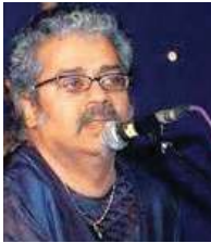
PADMASHRI A. HARIHARAN RENOWNED GHAZAL AND FILM PLAYBACK SINGER