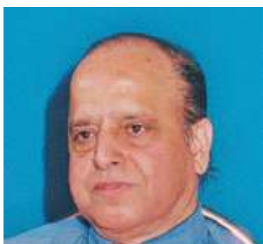
Padma Vibhushan Dr.K.Kasturirangan Ex-Chairman, ISRO, Former member of Parliament, Member Planning Commission, Former Chairman- National Education Policy & our alumnus and former teacher