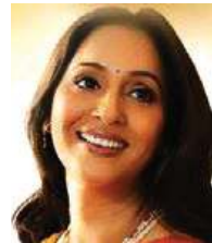
ASHWINI BHAVE FILM ACTRESS