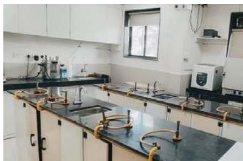
• Bioanalytical Sciences Lab