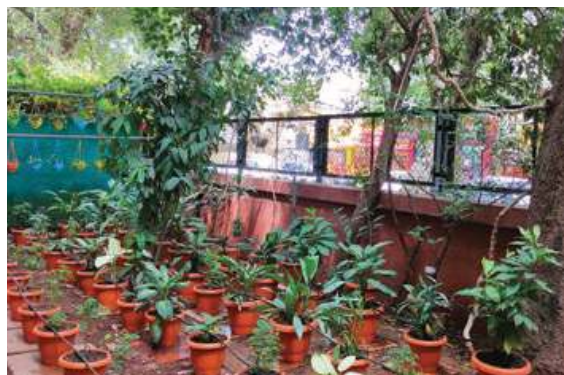
• Herbal Garden