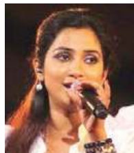
SHREYA GHOSHAL RENOWNED FILM PLAYBACK SINGER, NATIONAL AWARDEE