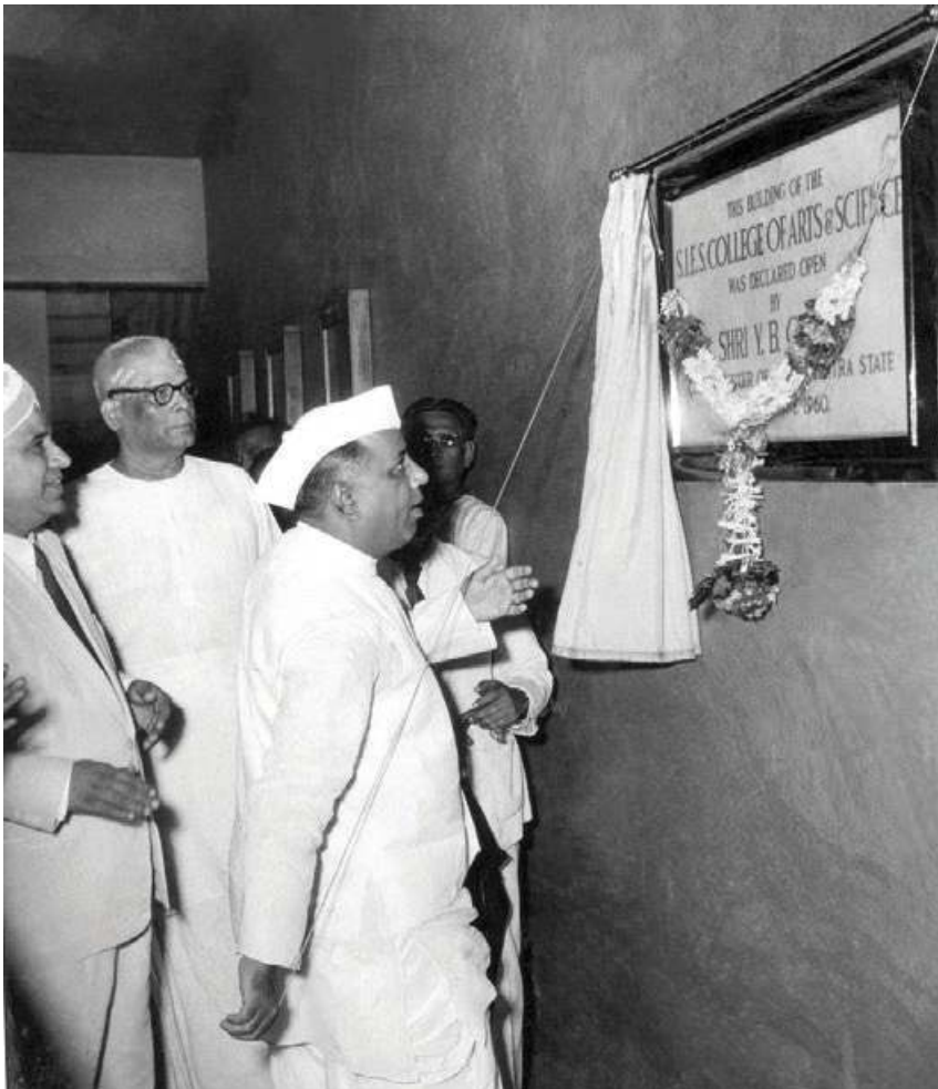
Shri. Y.B. Chavan, Chief Minister of Maharashtra inaugurating SIES College of Arts, Science & Commerce, Sion (W) on 19 th June 1960.

“The society serves the cause of education and the educational needs of the common man of this cosmopolitan city.”