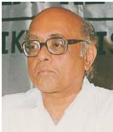
Padma Vibhushan Dr. R. Chidambaram Principal Scientific Advisor to the Government of India