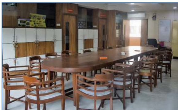
• Academic Staff Center