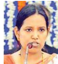
VARSHA GAIKWAD EX-CABINET MINISTER OF MAHARASHTRA