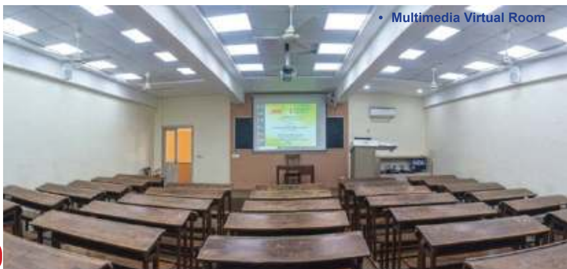
• Multimedia Virtual Room