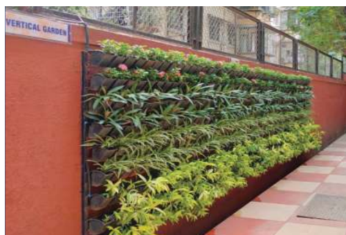
• Vertical Garden