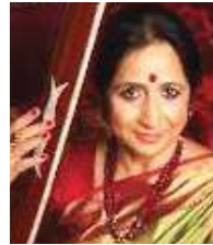
PADMASHRI ARUNA SAIRAM FAMOUS CARNATIC MUSIC VOCALIST