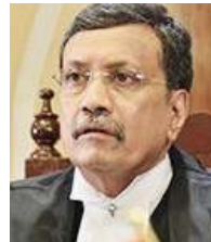
JUSTICE P. D. KODE HONORABLE (RETIRED), BOMBAY HIGH COURT